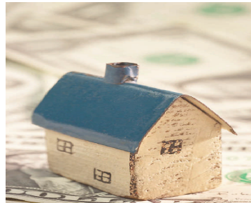
Funds from local businesses help to ensure success for DV victims.

Inc. recognizes the need for victims of domestic violence to become empowered economically in order to, access and maintain housing, support a single-parent household, and succeed in becoming an independent individual.