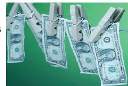
KDVA's IDA program gives a 200% return on investment for 2 years.

their asset thanks to the IDA program. Due to an increase in fraud in recent years, many people have errors on their credit report. Our clients are also learning the importance of checking their credit report regularly and how to correct errors. Our clients all have the opportunity to clean up their credit report with a homeownership counselor.