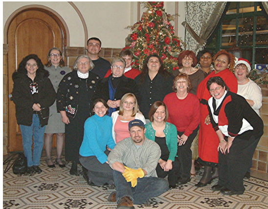
Picture taken at the Barren River Area Safe Space's annual staff Christmas party '05.

The mission of BRASS, Inc. is to ensure that the victims of domestic violence and their children live free from any form of domestic abuse, and that their rights are valued, protected, and defended. The primary domestic violence service provider in the region,